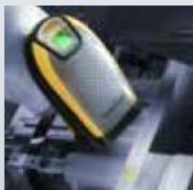
Hand Held scanners