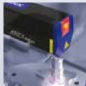
Laser Marking Systems