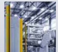
Safety Light Curtains