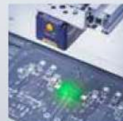
Stationary Industrial Scanners